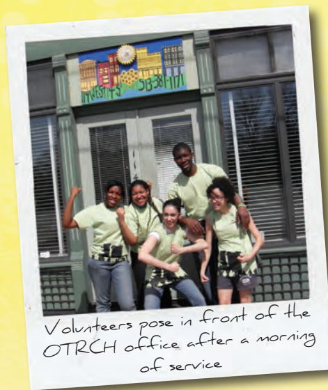
Volunteers pose in front of the OTRCH office after a morning of service