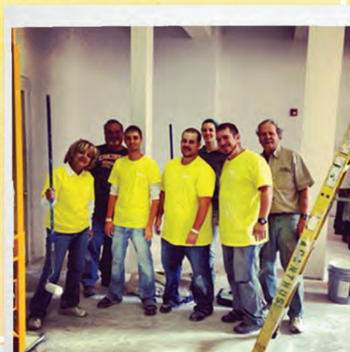
OTRCH staff and residents, and volunteers from Microsoft worked together to paint storefront at 1501 Republic