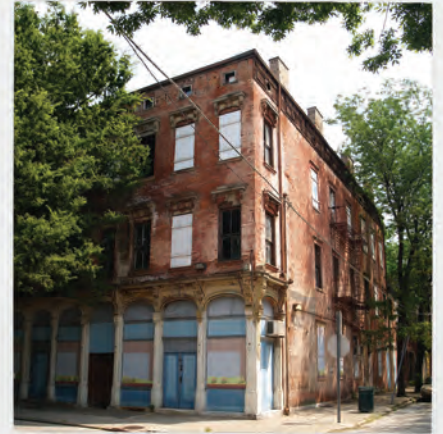
1500 Elm Street, now

• 15 units of affordable senior housing Approval of a HUD 202 grant provided the central funding piece of this project. In partnership with The Model Group, we were able to complete funding for the project, winding up a lot of hard work to put together this project's complicated financing. 1500 Elm Street is the first senior-specific housing project in Over-the-Rhine. Construction on this important project will begin in June 2013.