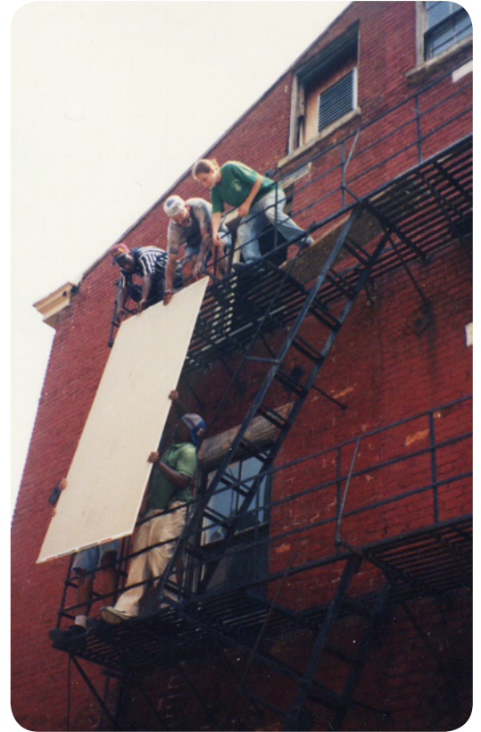
ReSTOC volunteers, year unknown