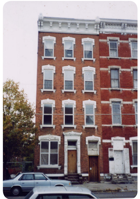
ReSTOC's first building

OTRCH started in 1978 as a small housing cooperative called ReSTOC (Race Street Tenant Housing Cooperative), named after ReSTOC's first building, which was located on Race Street. The primary mission of ReSTOC was to be a place where previously homeless residents of the Drop Inn Center could access safe, affordable housing. Before ReSTOC, there were no housing options for persons leaving the Drop Inn Center, as landlords refused housing referrals from the DIC.