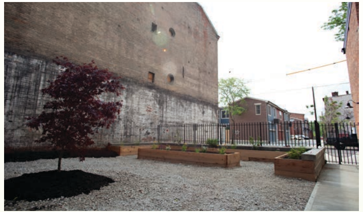
Garden In Honor of Ettore Januzzi