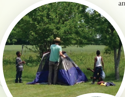
Tent is Up!

When the facilitators of Children's Creative Corner (CCC) sat down to brainstorm some great ways to start this sunny season, they collectively reflected on some of their favorite childhood memories of summertime; nights spent looking up at the starry sky, playing games in the yard in bare feet, getting up the gusto to dive through the cool spray of the sprinkler, hotdogs and hamburgers fresh off of the grill, and s'mores around the campfire seemed to swirl together to create a happy sense of nostalgia. In an effort to share and celebrate these summer staples again, ten CCC students and 6 adult volunteers traveled to Plain City, Ohio the first weekend in June for an overnight camp-out.