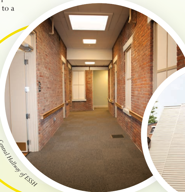
Central Hallway of ESSH