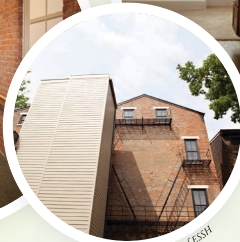
Back (and up!) of ESSH