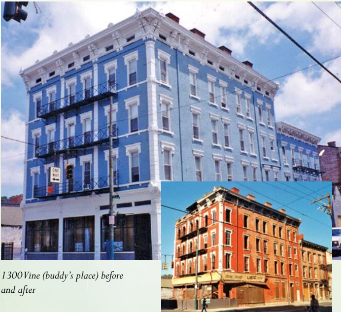
1300 Vine (buddy’s place) before and after

Regretfully, as many as 24,000 Cincinnati households, can not afford to rent suitable housing in the traditional market place. That is where different types of subsidy programs help. The most commonly known housing subsidy is governmental, Section 8 certificates. Less known is organizations like OTRCH which develop housing units so that rent without public subsidy is within reach of very and extra low income households.