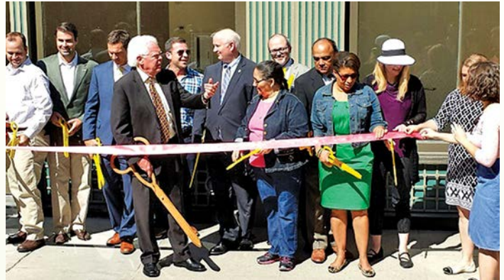
Beasley Place Ribbon Cutting

also saw lots of new people. It was these changes, mixed with my experience of OTR years ago, that excited me.