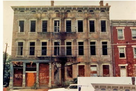
145-147 Mulberry Before

To help answer that question, OTRCH is working with the Over-the-Rhine Community Council and the Community