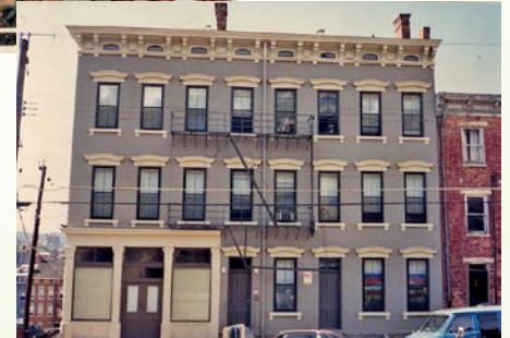
145-147 Mulberry After

Building Institute of Xavier University to conduct an Over-the-Rhine Housing Inventory Study. Funders of the study are OTRCC, 3CDC, PNC Bank, Greater Cincinnati Foundation, and Ohio Capital Corporation for Housing. Results of the study should be available in 2016.