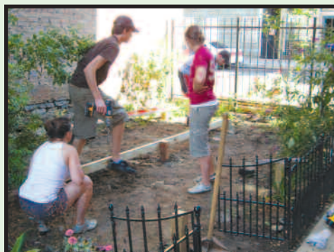
Volunteers build a deck for a resident