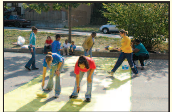
Students and residents work to improve the Rothenberg playground

Over-the-Rhine for Education in Public Schools (OTREPS) is the neighborhood group taking the lead in our neighborhood efforts at Rothenberg. OTREPS is a group that consists of parents, community members, teachers, school staff and volunteers. OTRCH is one of the group's sponsors, along with Contact Center and Peaslee Neighborhood Center.