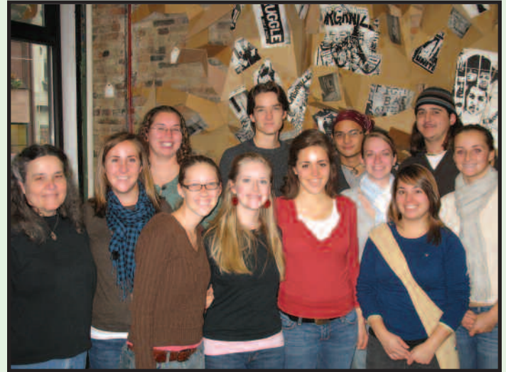
Students of Miami University's Over-the-Rhine Residency Program