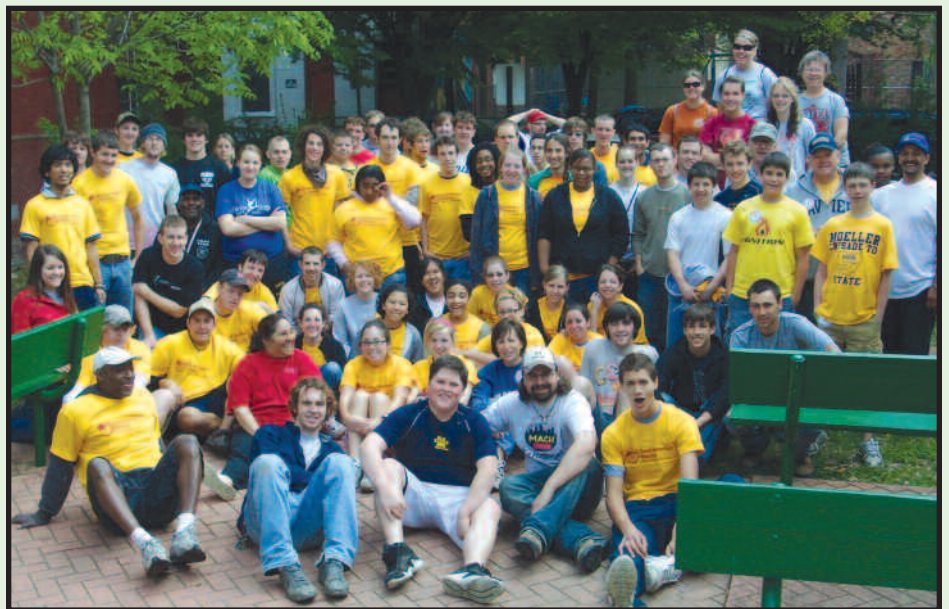
Volunteers at the Great American Cleanup Day!