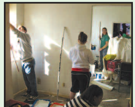
Volunteers paint a resident's apartment