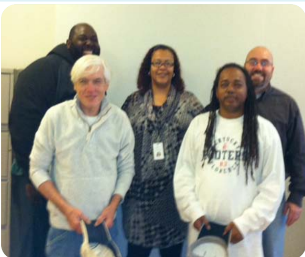
Jimmy Heath House Service Team